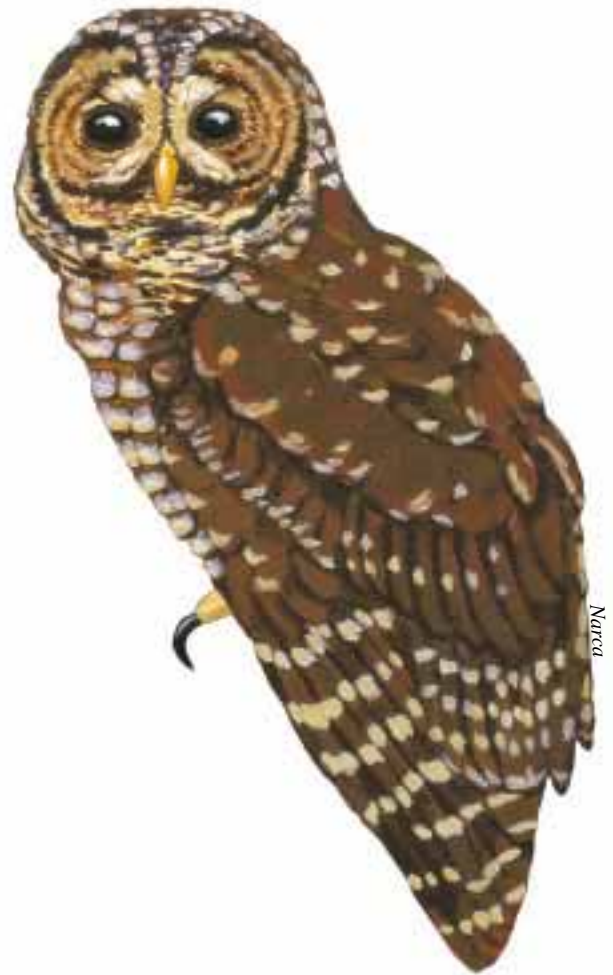
Mexican Spotted Owl